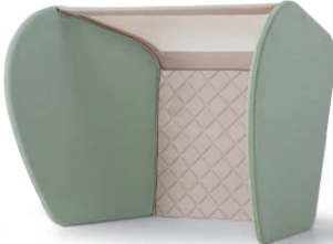
DMP-B01C - G2M1G22J 2