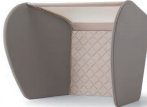
DMP-B01C - G2M1G2MA 2