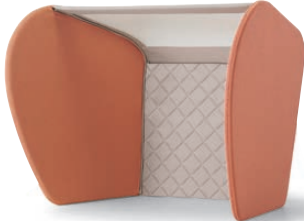
DMP-B01C - G2M1G20Y 2